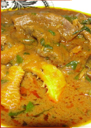
Banga Soup (Nigeria)