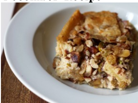
Umm Ali from Egypt